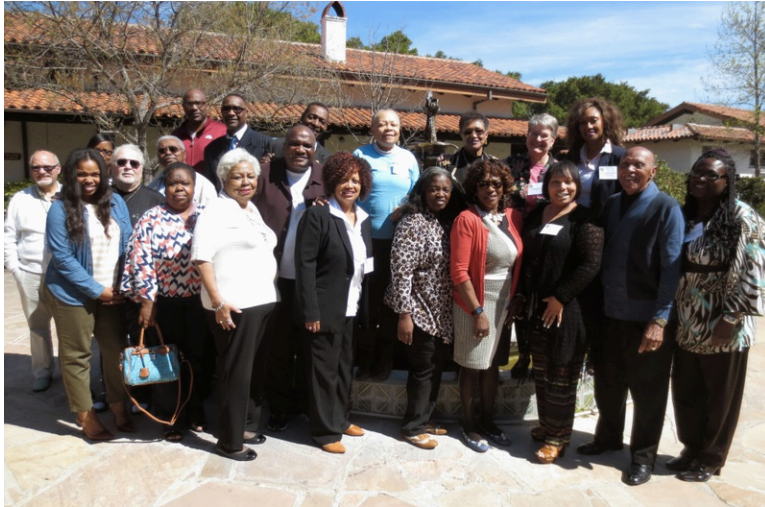
Alameda County and Contra Costa County